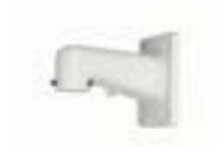
DH-PFB305W Wall mount bracket