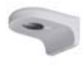
DH-PFB204W Wall mount bracket